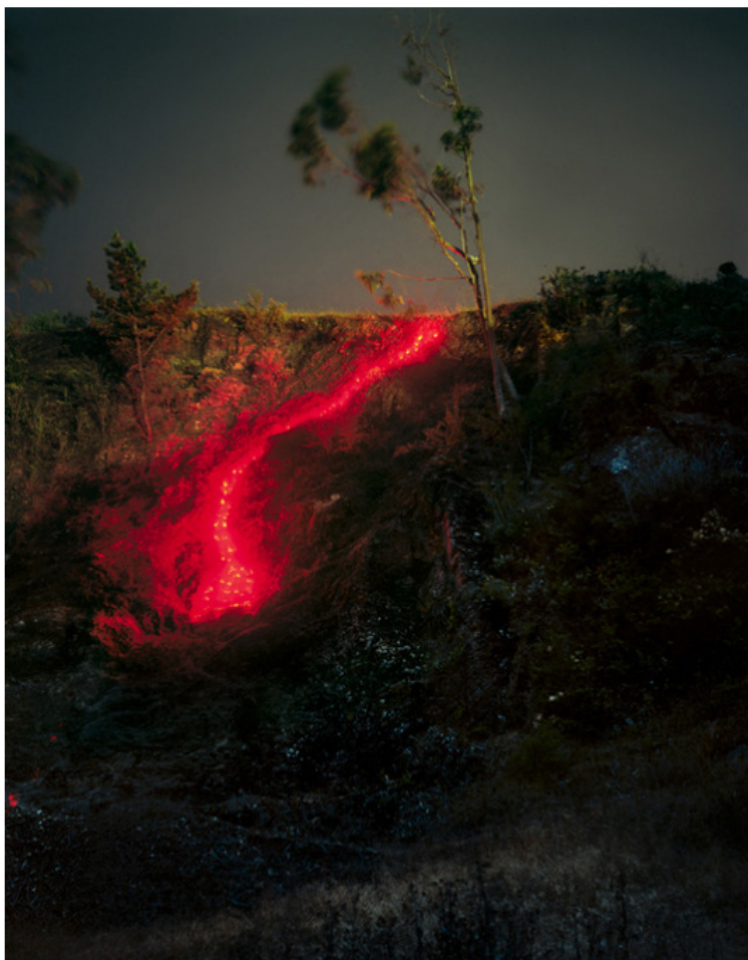
Headlands II (2009)