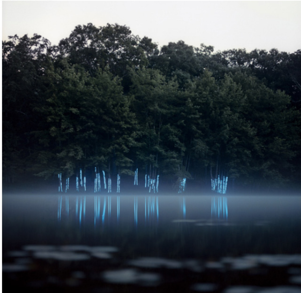
Traces (Blue) 2008