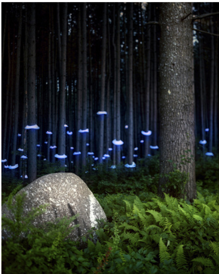
Fems (For Francesca) (2012)