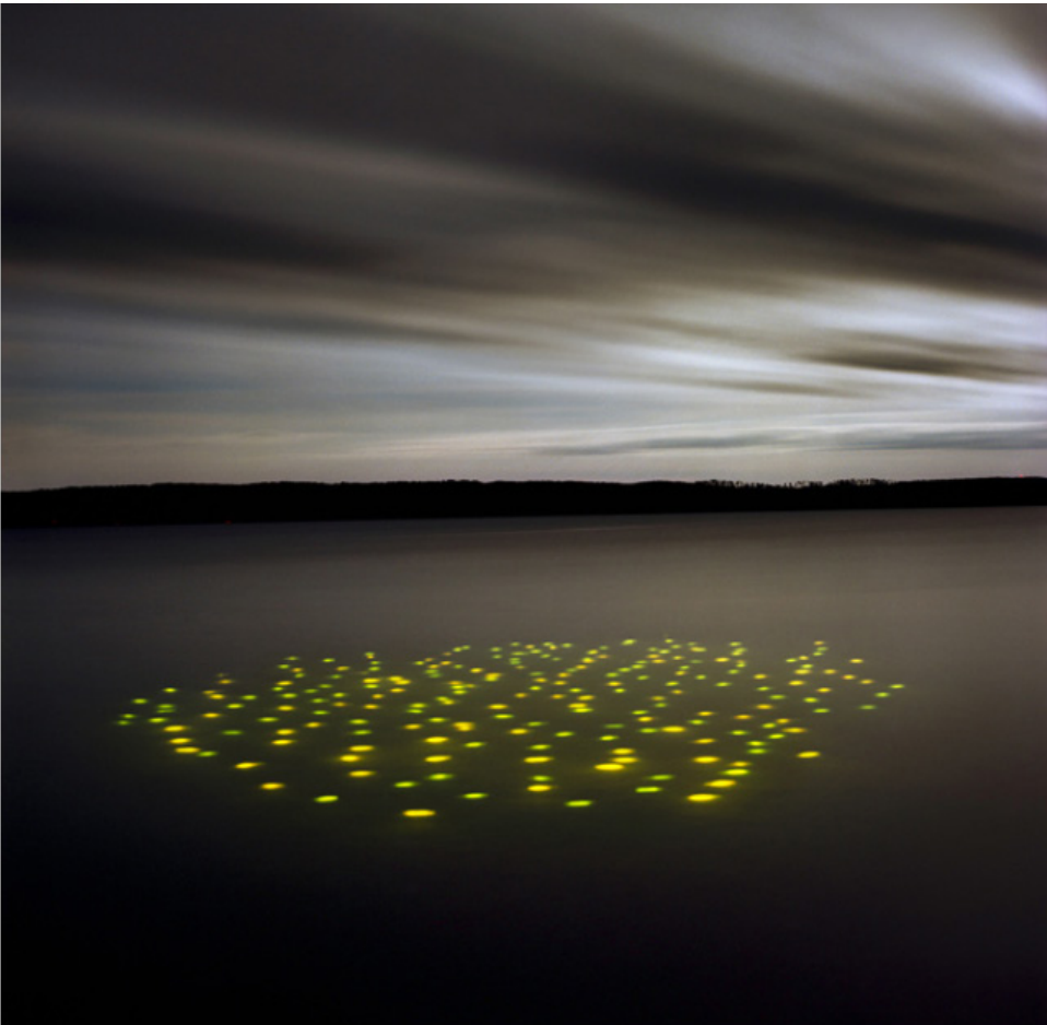
Fish II (2003)