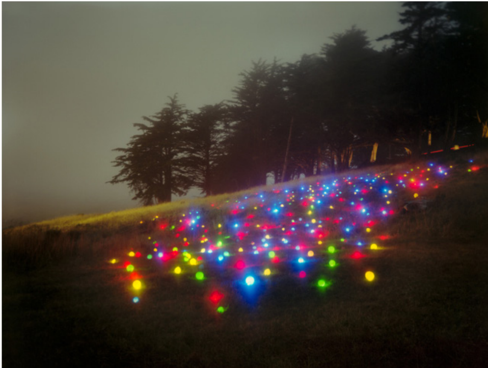
Parade Field (2009)

At the Sous Les Etoiles exhibition, Underwood will be showcasing some of these old pieces alongside a newer, unreleased series of work. Until the latter make their debut, keep your excitement piqued by revisiting what made him stand out in the first place.