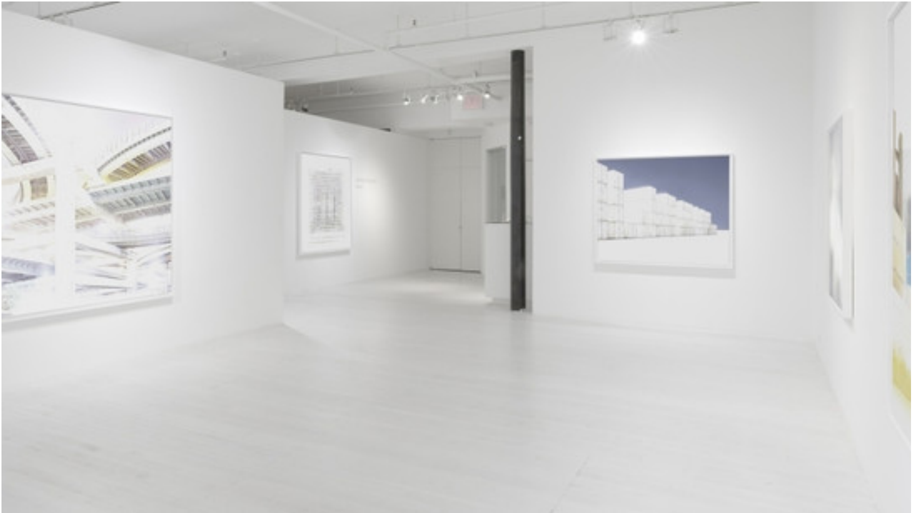
Blank, Exhibition view.

Sous Les Etoiles Gallery is pleased to announce “Blank,” German photographer Andreas Gefeller’s premiere exhibition with the gallery.