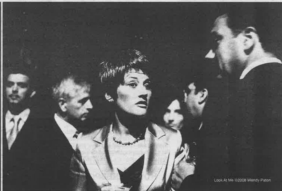
Look At Me