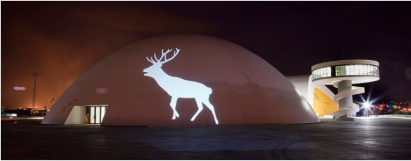
Projection at the Niemeyer Center.