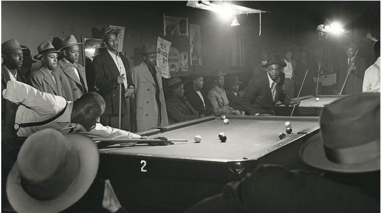
Wayne Miller, From "The Way of Life of the Northern Negro," Chicago (Afternoon Game at Table 2), 1946-1948