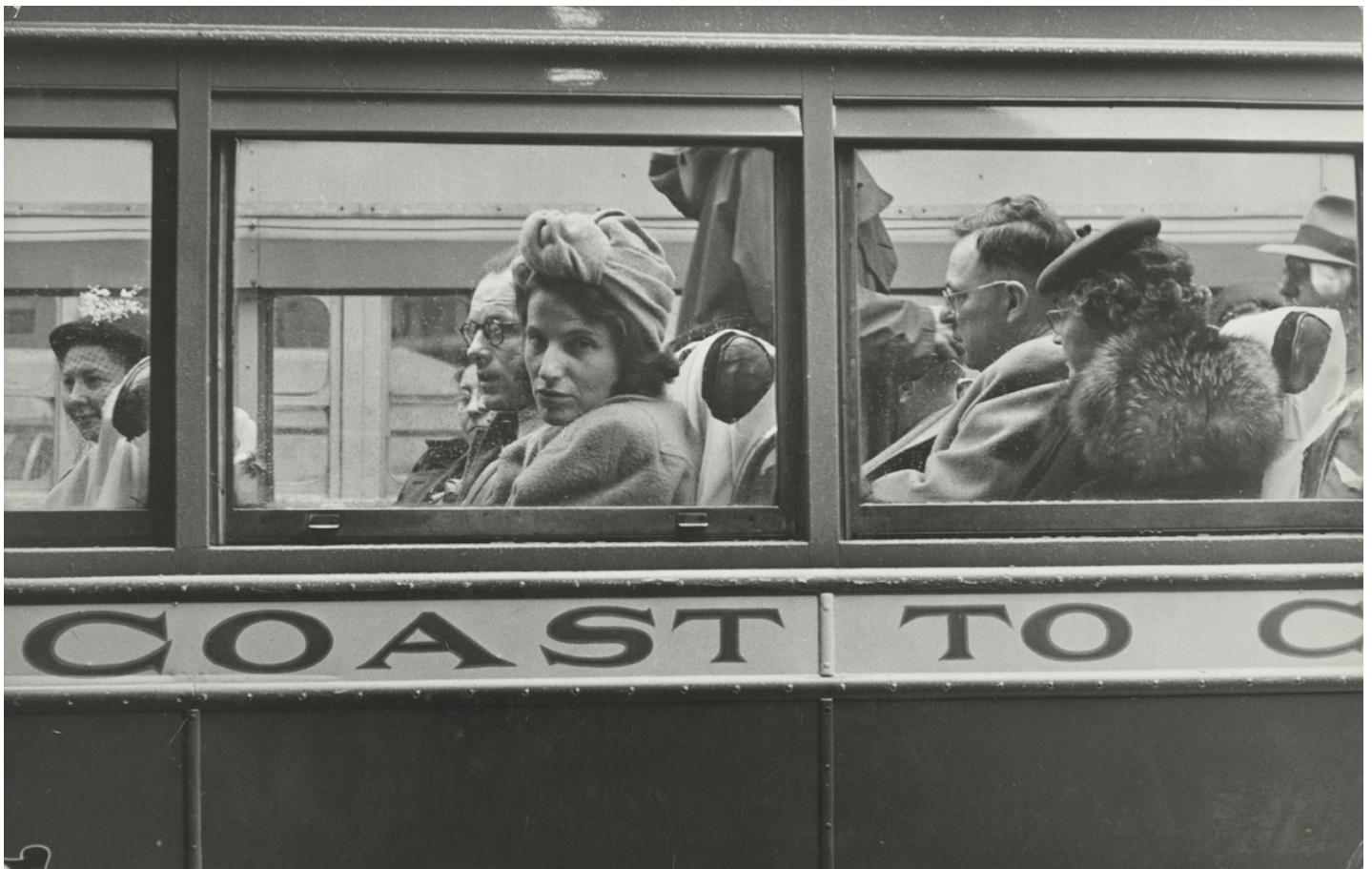
Esther Bubley, Coast to Coast, SONJ, 1947, © Estate Esther Bubley/ courtesy Howard Greenberg Gallery/ Sous Les Etoiles Gallery