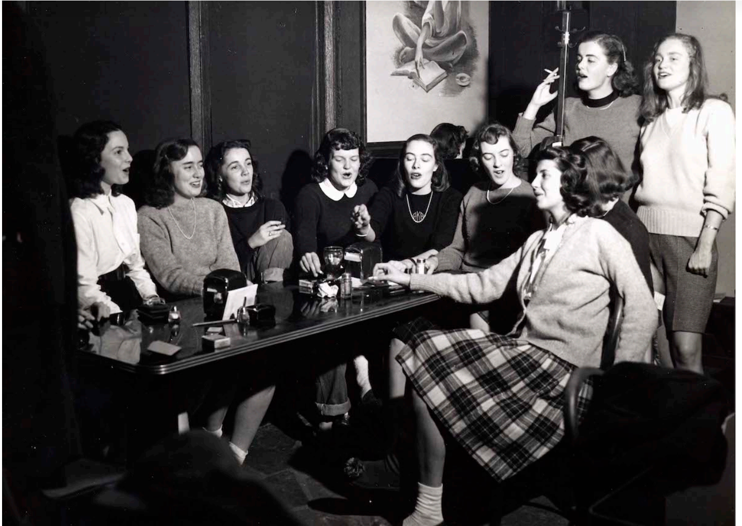
Vassar Girl, Alumnae Pub Mural , Vassar College 1947, courtesy Archives/ Collection of Vassar College and Sous Les Etoiles Gallery