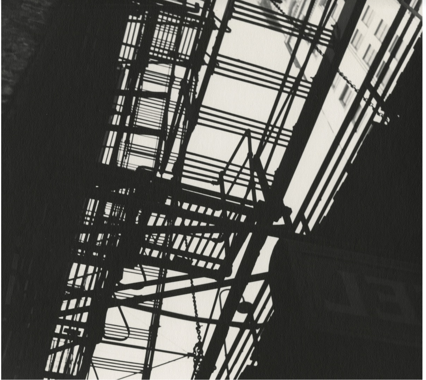
Ferenc Berko, Fire Escape, Chicago, 1947, Courtesy Tom Gitterman Gallery/ Sous Les Etoiles Gallery