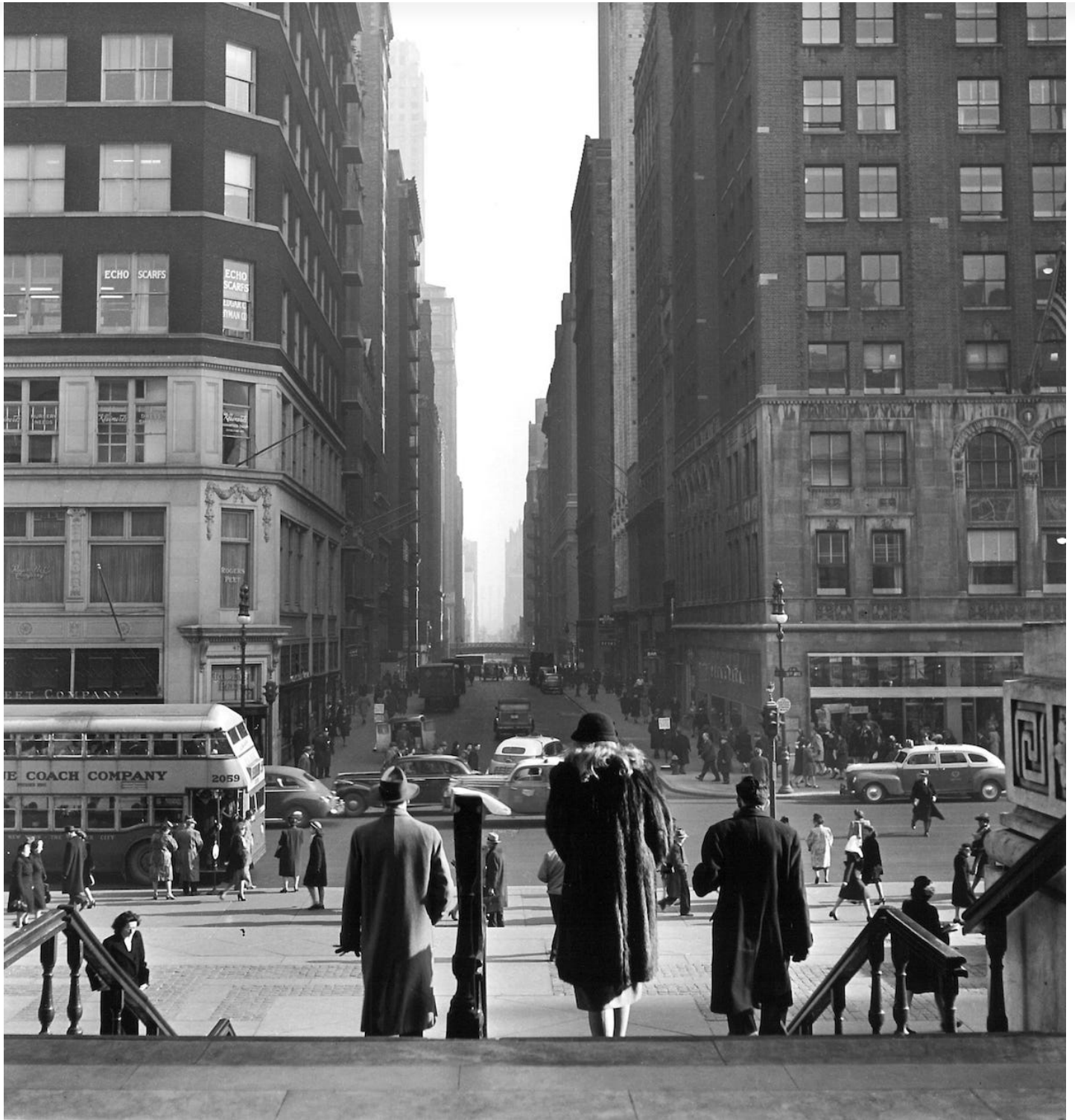
Ida Wyman, Looking East on 41st Street, New York , 1947, courtesy Stephen Cohen Gallery/ Sous Les Etoiles Gallery