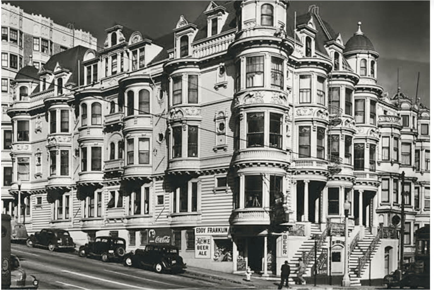
Max Yavno, Ferry Building, San Francisco, 1947, Courtesy Scott Nichols Gallery/ Sous Les Etoiles Gallery