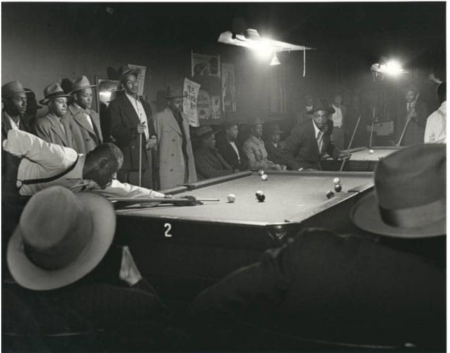
From "The Way of Life of the Northern Negro," Chicago (Afternoon Game at Table 2), 1946-1948