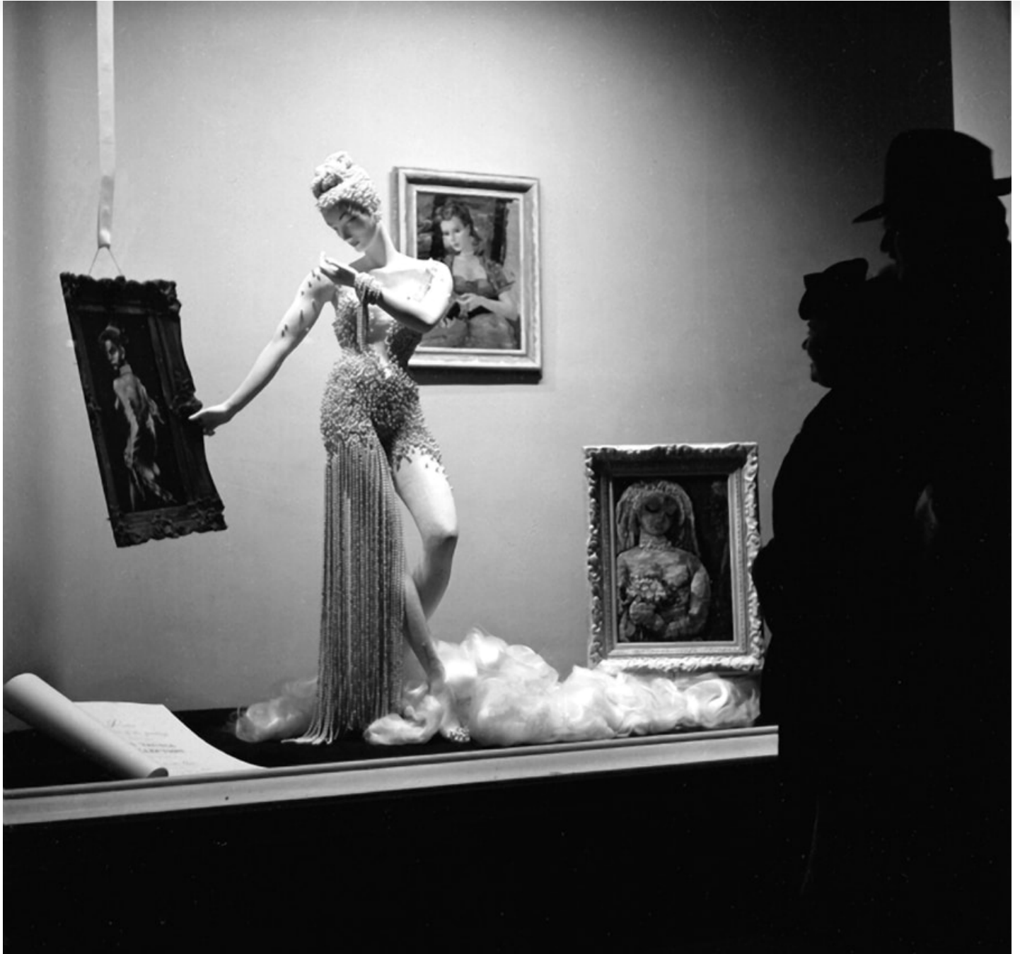
Bonwit Teller Window, New York, 1947

Sous Les Etoiles Gallery: Website | Facebook | Instagram