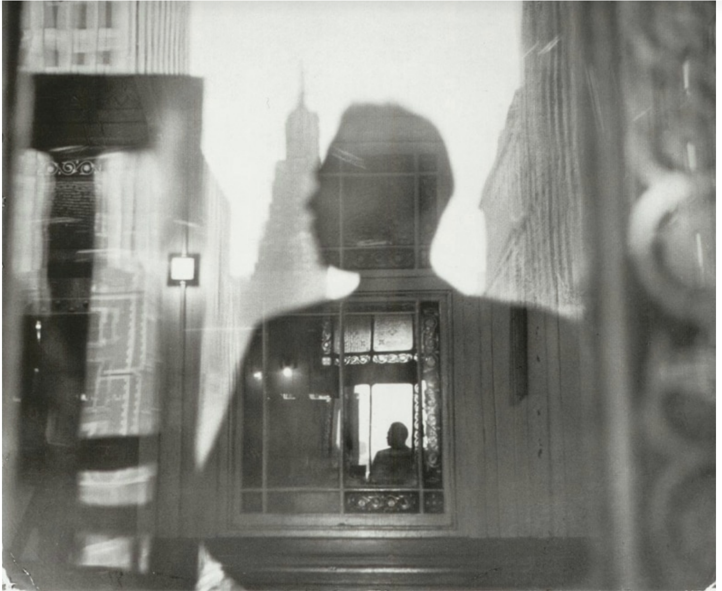
Louis Faurer, New York, NY, 1947 (profile head in El window), Courtesy Deborah Bell Gallery/ Sous Les Etoiles Gallery