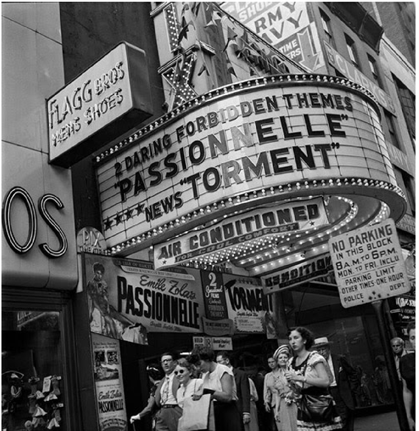
Tony Vaccaro, Pix Theater, New York, 1947, courtesy Monroe Gallery/ Sous Les Etoiles Gallery